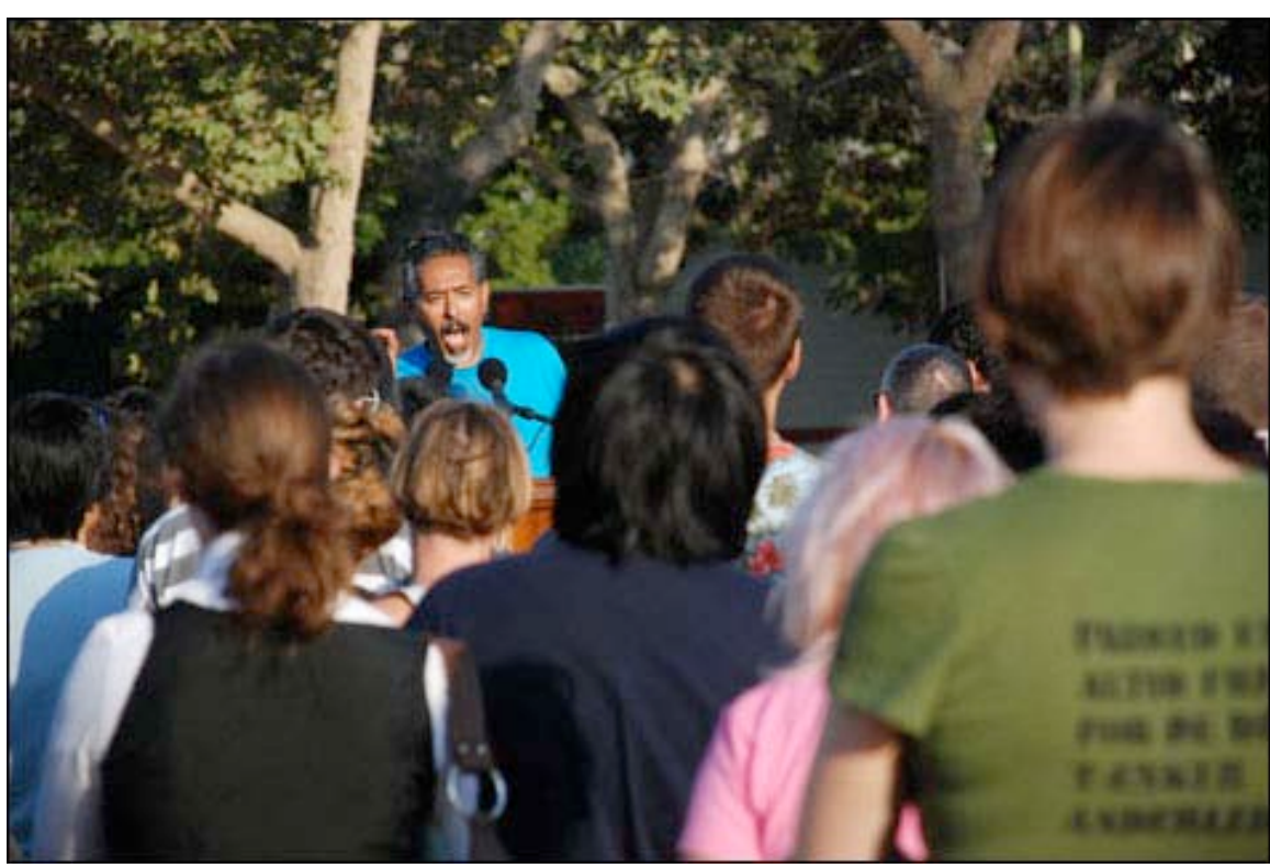
SPEAK OUT: A demonstration, organized as part of Tribe's project, contrasts with today's more muted anti-war movement.

Can reenacting Vietnam-era protests help us rethink Iraq? By GREG COOK | October 22, 2008 | Recommended By 6 People Photos: Guy Fawkes Day